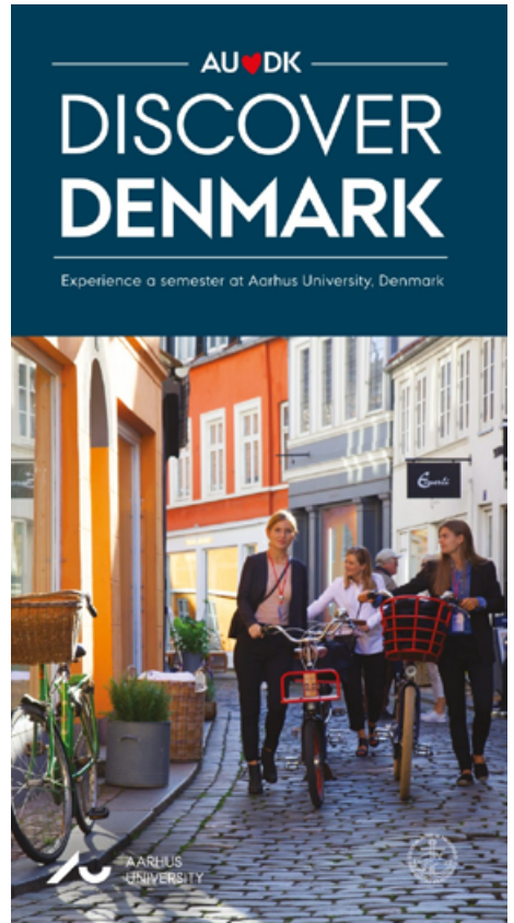
Cover page for a couple of our brochures